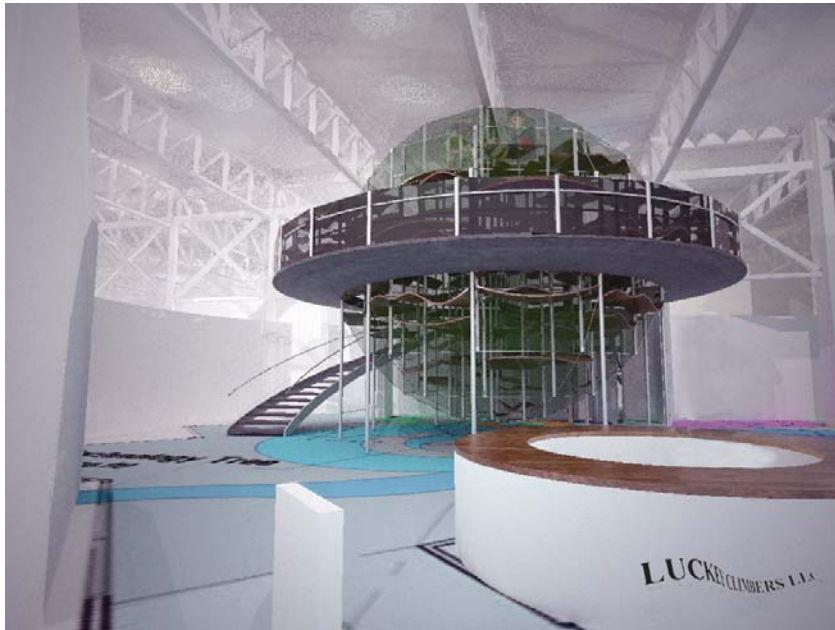
The Stratosphere exhibit.